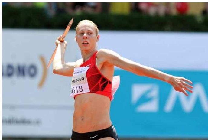
Tatyana Chernova en route to a big personal best of 6773 in Kladno

Kladno, Czech Republic – Tatyana Chernova of Russia took a big Heptathlon victory while Cuban Leonel Suárez triumphed in the Decathlon at the 5th TNT-Fortuna IAAF World Combined Events Challenge meeting on Thursday (16).